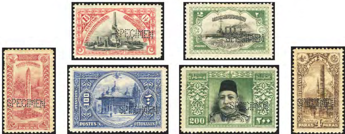
1914 definitive issue — 'SPECIMEN' type B1