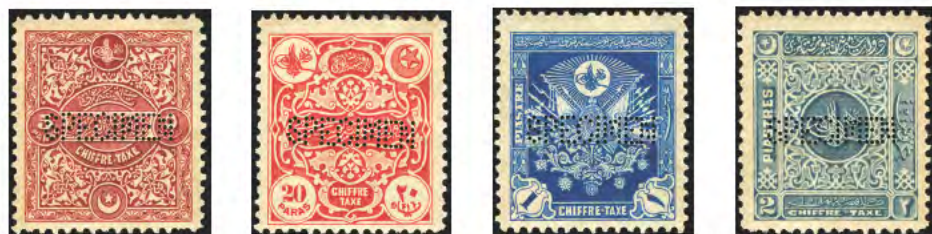
1914 Postage Due — 'SPECIMEN' type B1