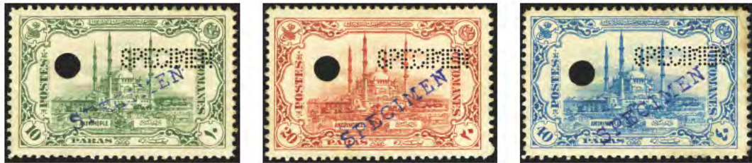
1913 Recapture of Adrianople 'SPECIMEN' type B1, punched 4½mm hole and 'SPECIMEN' type BEC2a ex Bechuanaland collection

The 1913 to 1914 postage and Postage Due stamps were perforated 'SPECIMEN' type B1 by Bradbury Wilkinson, the printers of the stamps.